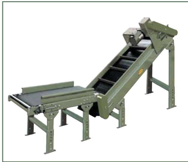
FEEDER SHOWN WITH STANDARD PC TYPE GUARD RAIL, GRAVITY BRACKET WITH POP-OUT ROLLER AND OPTIONAL MS TYPE FLOOR SUPPORTS

CAPACITY —300 lbs. total distributed load at 65 FPM.