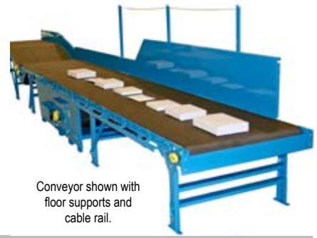
Conveyor shown with floor supports and cable rail.