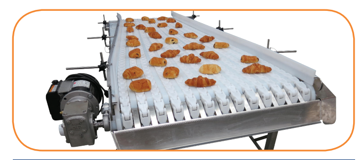
Product Separation & Spacing