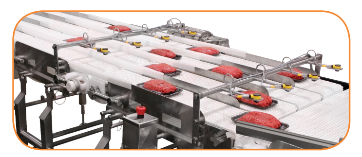
Merging & Diverting