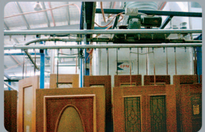
Large wooden doors are conveyed from the finishing line through the assembly process to shipping.