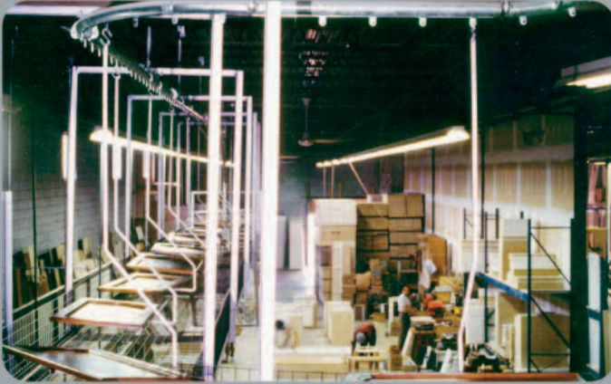
Paint line conveyor moves kitchen cabinets into warmer, unused overhead space for shorter drying time.

For handling lighter parts that require full paint coverage on all areas and when open access to the floor is required.