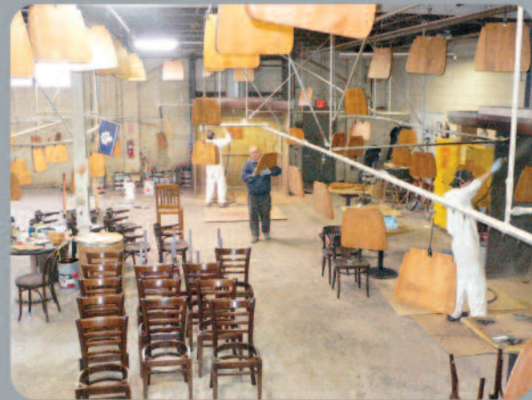
Single conveyor line moves product through finishing process from sanding to staining, lacquer and drying.