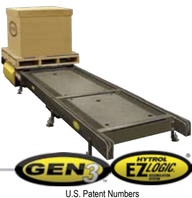
U.S. Patent Numbers 5,862,907 • 7,243,781 • 7,591,366 Other Patents Pending.