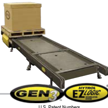
U.S. Patent Numbers 5,862,907 • 7,243,781 • 7,591,366 Other Patents Pending.