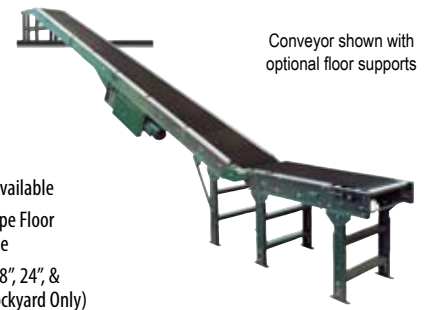
Conveyor shown with optional floor supports